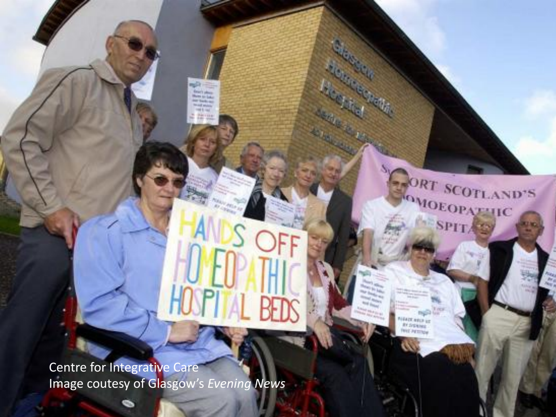
Centre for Integrative Care