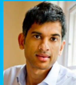
Dr Rangan Chatterjee NHS GP