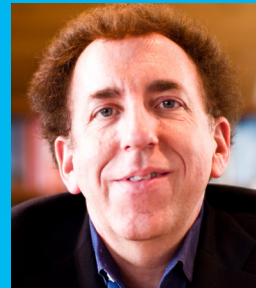
Dean Ornish MD