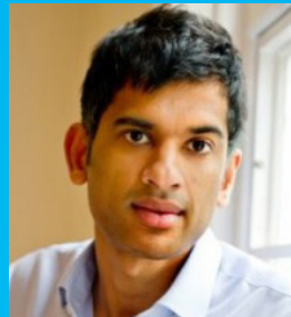
Dr Rangan Chatterjee